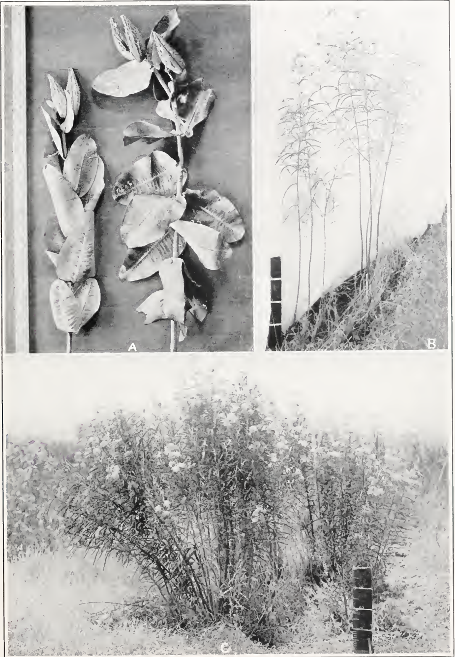
A. Asclepias sullivanti , collected at Lincoln, Nebraska.